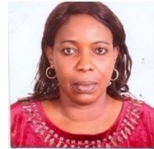
Passport Sized Photograph